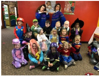
Heavenly Sunshine Preschool

Halloween Costumes. They went Trick n Treating in downtown Isanti