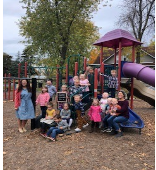
Heavenly Sunshine Preschool.

Enjoying a break outside during the school day.